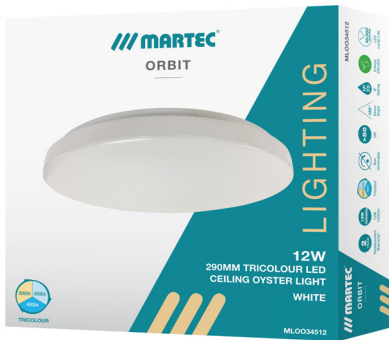
12W Illustration only shown for packaging example.